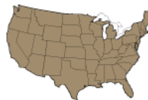
Slateline® shingles are available nationwide